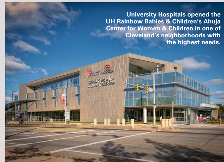
University Hospitals opened the UH Rainbow Babies & Children’s Ahuja Center for Women & Children in one of Cleveland’s neighborhoods with the highest needs.