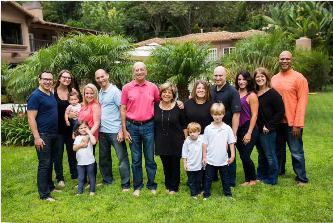
The Family Photo